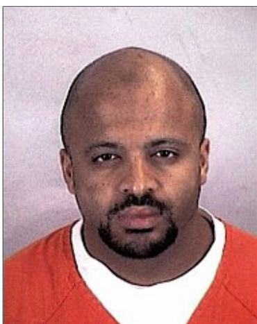
This August 2001 file photo released by the Sherburne County Sheriff Office shows Zacarias Moussaoui. After a volite opening, the jury selection process for Moussaoui continues this week in Alexandria, Va. Jury selection will be particularly difficult for the defense. The team must find an unbiased panel for a man who prosecutors say could have prevented the Sept. 11 attacks on the World Trade Center and the Pentagon, just a few miles from the courthouse where the trial takes place.

Prosecutors must directly link Moussaoui to the attacks to obtain the death penalty. They plan to do so by arguing that Moussaoui's lies to investigators when he was arrested in