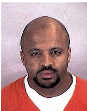
This August 2001 file photo released by the Sherburne County Sheriff Office shows Zacarias Moussaoui. After a volitive opening, the jury selection process for Moussaoui continues this week in Alexandria, Va. Jury selection will be particularly difficult for the defense. The team must find an unbiased panel for a man who prosecutors say could have prevented the Sept. 11 attacks on the World Trade Center and the Pentagon, just a few miles from the courthouse where the trial takes place.